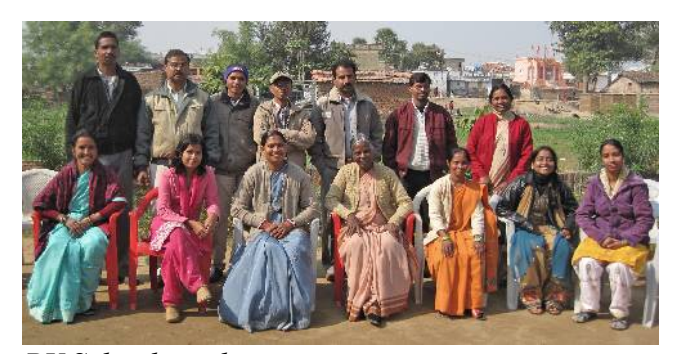
PV School teachers

The visit was very productive and it's lovely to see how the school is developing.