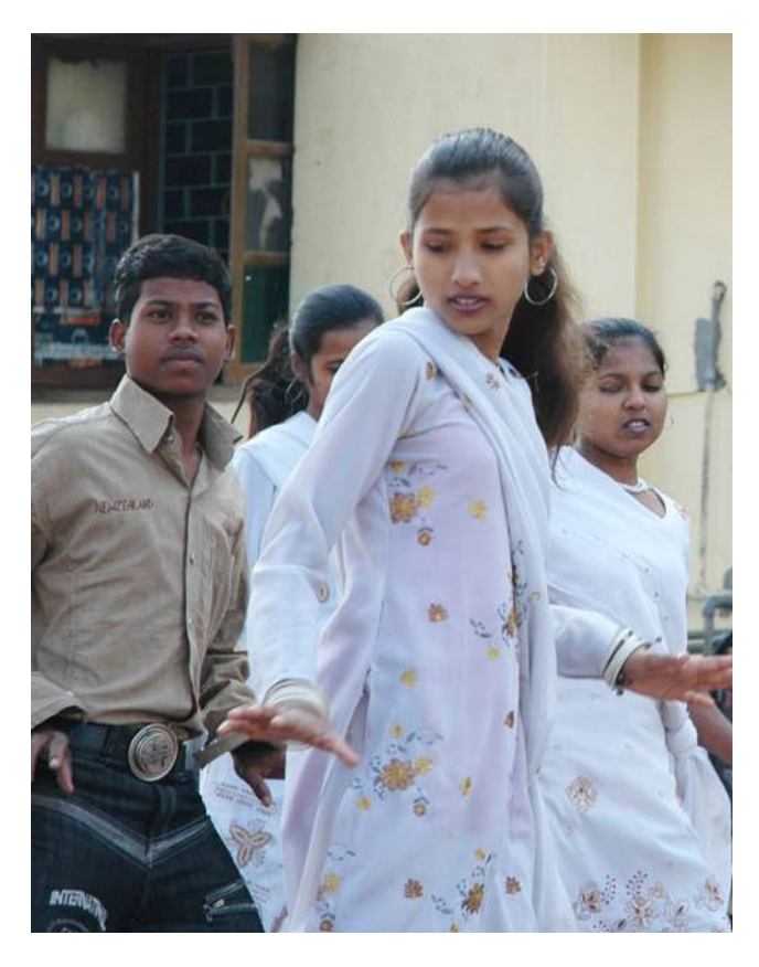
Photos of elegantly dressed Indian students dancing could give the impression that these students don't come from such poor backgrounds but the clothes or costumes belong to the school.

Often after a dance performance for westerners, some of the dancers try to get the westerners to come into the stage area to dance with them. The westerners sometimes do free-form dancing which can seem very strange and inelegant to Indian eyes. This is some of the PV students watching westerners dance.