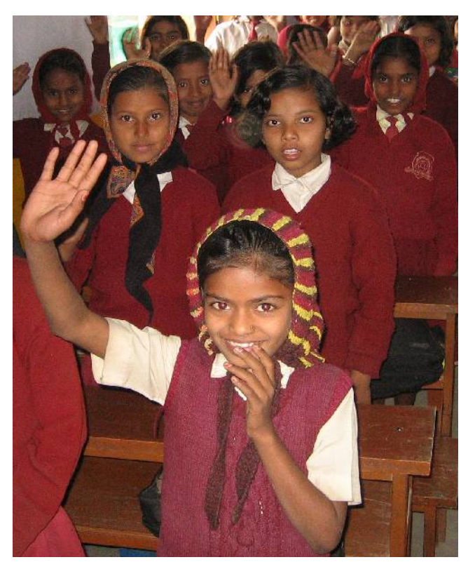
Can I answer?

Our school too celebrated Teachers' Day. The school contributed some money for this day and gave thanks for the 584 students. There was a tea party for the 17 teachers and a cultural program given by the students. They managed the show very well with a short and well-disciplined program. One could see the self confidence and the emerging potential in them. Many of our Year X students too came to express their love & gratitude to their teachers.